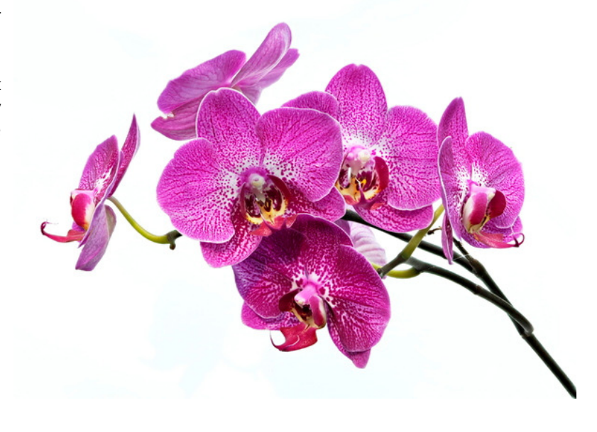
PRINT OF THE MONTH Theme — Repetition Many Orchid Blooms — Cecily Jones